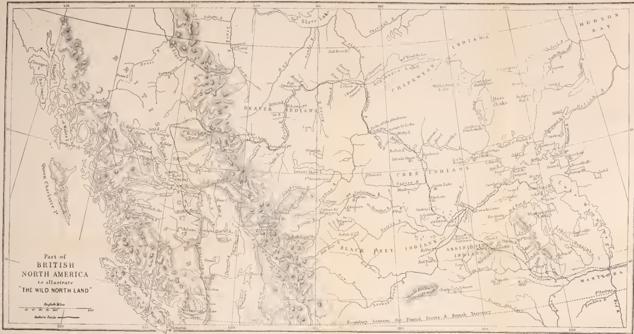
Part of BRITISH NORTH AMERICA to illustrate "THE WILD NORTH LAND"